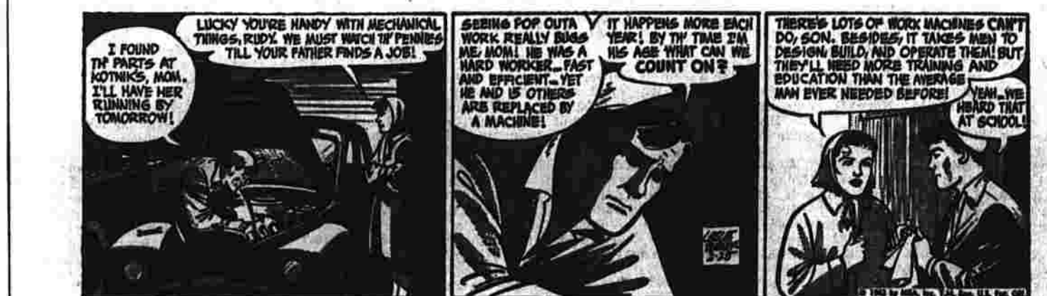
OUR BOARDING HOUSE