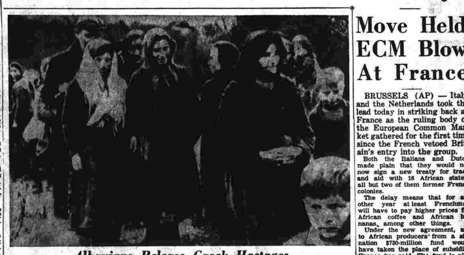
Albanians Release Greek Hostages

Communist Albania has returned 129 more Greeks taken prisoner during the Communist civil war in Greece in 1948-49. Most of the prisoners were permitted to bring personal belongings.